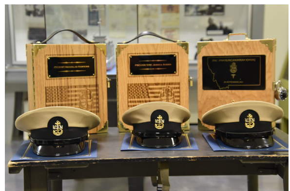
CPO covers, certificates and promotion boxes presented to new CPO's