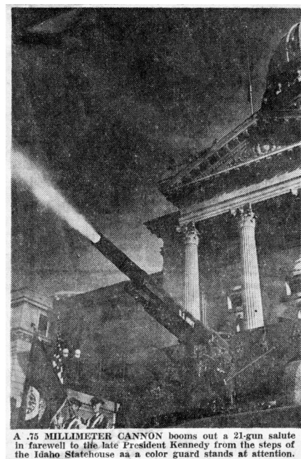
Below: Idaho Dailey Statesman picture 1963