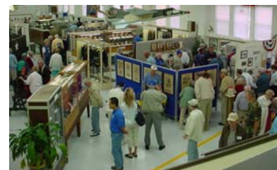
388 th Bombardment Group Visits Museum

➤ On September 6 th , the 388 th Bombardment Group, which traces its history back to Gowen Field and the B-17 Flying Fortress, was given a tour of Gowen Field. The Museum was one of