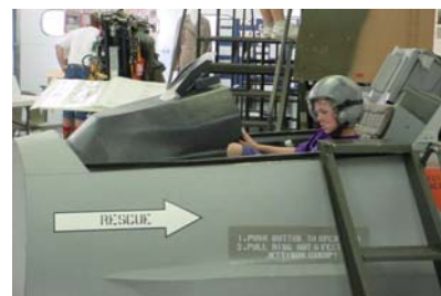
Pilot In Training at Open House

Over 100 visitors came by and joining us were the WWII Reenactors and the Civil War Reenactors. In addition, TV Channels 2, 7, and 12 sent camera crews over and all three stations had stories about us on their evening news. Channel 7 ran the story the next day as well!