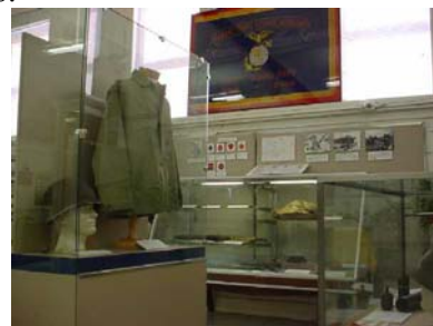
Part of the new Marine exhibit

➤ On September 2, 2002, we held an open house in celebration of our 7 th Anniversary! Yes, it has been 7 years since the doors to the Idaho Military History Museum opened; my how time flies!