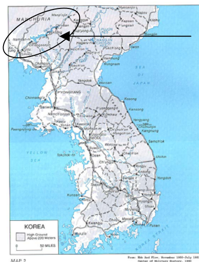
The Yalu river is right on the border between China and North Korea 3

"The Chinese officers that interrogated us were very well educated with most of them graduating from colleges in the U.S. They could speak better English than we could." 2 The Chinese also seemed to be concentrating on the younger and less educated POWs, trying to get them to defect. "As far as I know, no one from our camp was among the 21 that chose to stay there after the war was over." 2