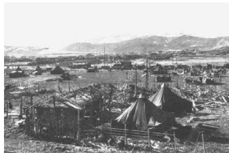
Chosin Reservoir, East Hill, 28 Nov 50 (Hagaru-ri, Korea) 1

They reported that at 7pm on the next day, Monday evening, that the Chinese troops would attack. Where did the Chinese come from? We had no idea that Chinese troops were even in the area. They weren't supposed to even be there. The 5th and 7th Marines were in defensive positions on the Yalu River holding that. We found out later that the Chinese had managed to work their way around our regimental defense positions.