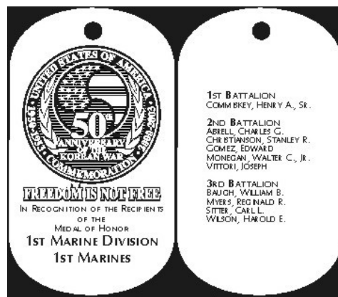
Commemorative 'Dog Tag' issued as part of 50 th Anniversary of Korean Conflict. 2

We dug in for the night. The next morning a Chinese machine gunner started laying grazing fire across the top of our Hill. This continued all day but we refused to leave our positions on top of East Hill. Of course, the Chinese were well dug in too.