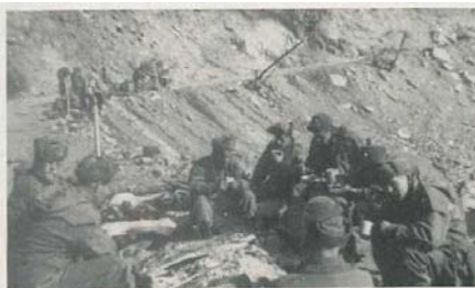
Break Time during road building

summer counteroffensive, they supported several different combat groups, including the 1st Marine Division, 2nd Army Division, 7 th Army Division, 3rd Infantry Division, and various Republic of Korea (ROK) divisions.