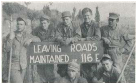
"Bloody Ridge Blvd, Travel the scenic route thru the courtesy of...116 th Engr C Bn"

In addition, the Bn was assigned maintenance control of the road between Oyupo and Inje, vital to X Corps 'supply needs. The Bn turned the unusable road into a two-way gravel-surfaced byway and then advanced to the front.