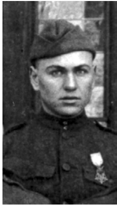
Thomas C. Neibaur