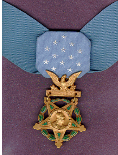
Army Medal of Honor as it appears today

On December 21st the bill was passed, authorizing 200 such medals be produced ‘which shall be bestowed upon such petty officers, seamen, landsmen and marines as shall distinguish themselves by their gallantry in action and other seaman like qualities during the present war (Civil War).’ President Lincoln signed the bill and the (Navy) Medal of Honor was born.” 1