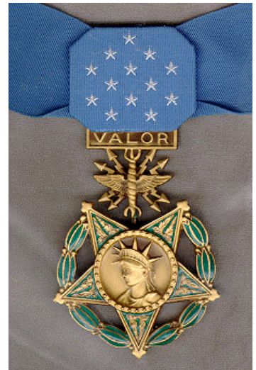
Air Force Medal of Honor as it appears today

----- “ I’d swap my stars for that medal ” - General John J. Pershing during WWI MOH presentation ceremony. -----