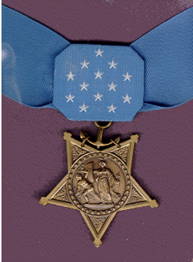
Navy Medal of Honor as it appears today

“On December 9, 1861 Iowa Senator James W. Grimes introduced S. No. 82 in the United States Senate, a bill designed to ‘promote the efficiency of the Navy’ by authorizing the production and distribution of ‘medals of honor’.